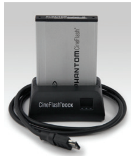
Phantom CineFlash Drive & CineFlash Dock