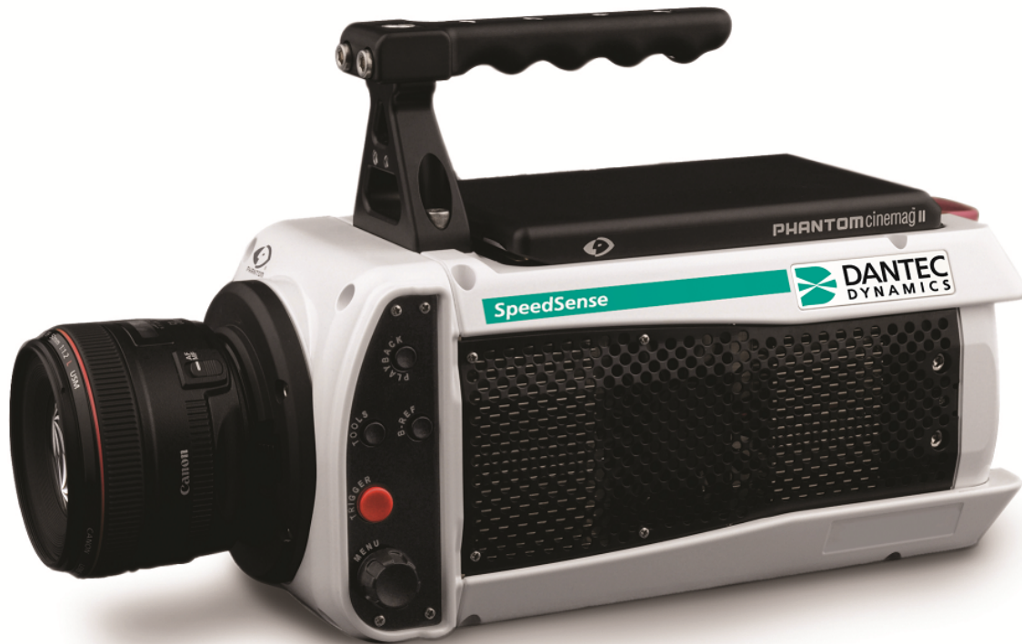
The SpeedSense camera family covers time resolved applications both in water and in air (Shown here is the SpeedSense v711 with optional on camera controls and Canon EOS lens.)