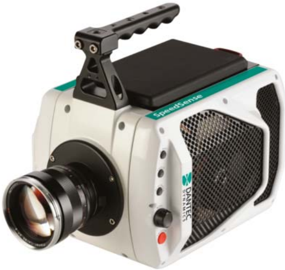
SpeedSense 1610, the world's fastest PIV camera