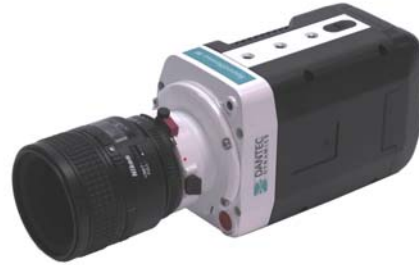
SpeedSense M X10, X20 and X40, new, compact cameras