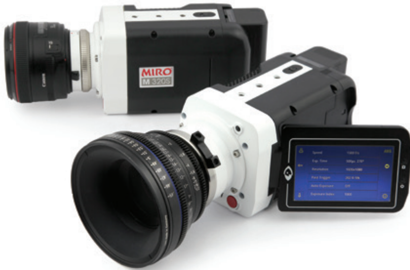
Phantom Miro LC320S with PL Mount (front) and Miro M320S with EOS Mount (rear)

For the most current version visit www.visionresearch.com Subject to change Rev August 2014